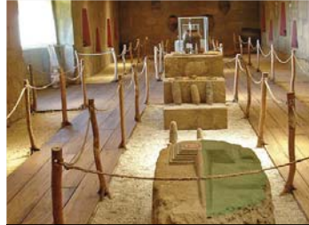
DAY 3: Cochasqui