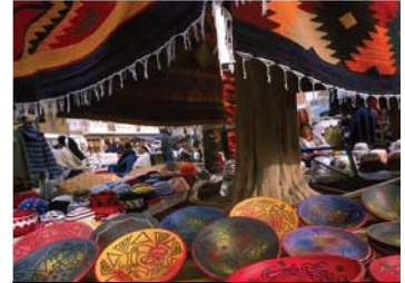
DAY 4: Handicraft markets