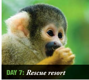
DAY 7: Rescue resort