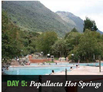
DAY 5: Papallacta Hot Springs