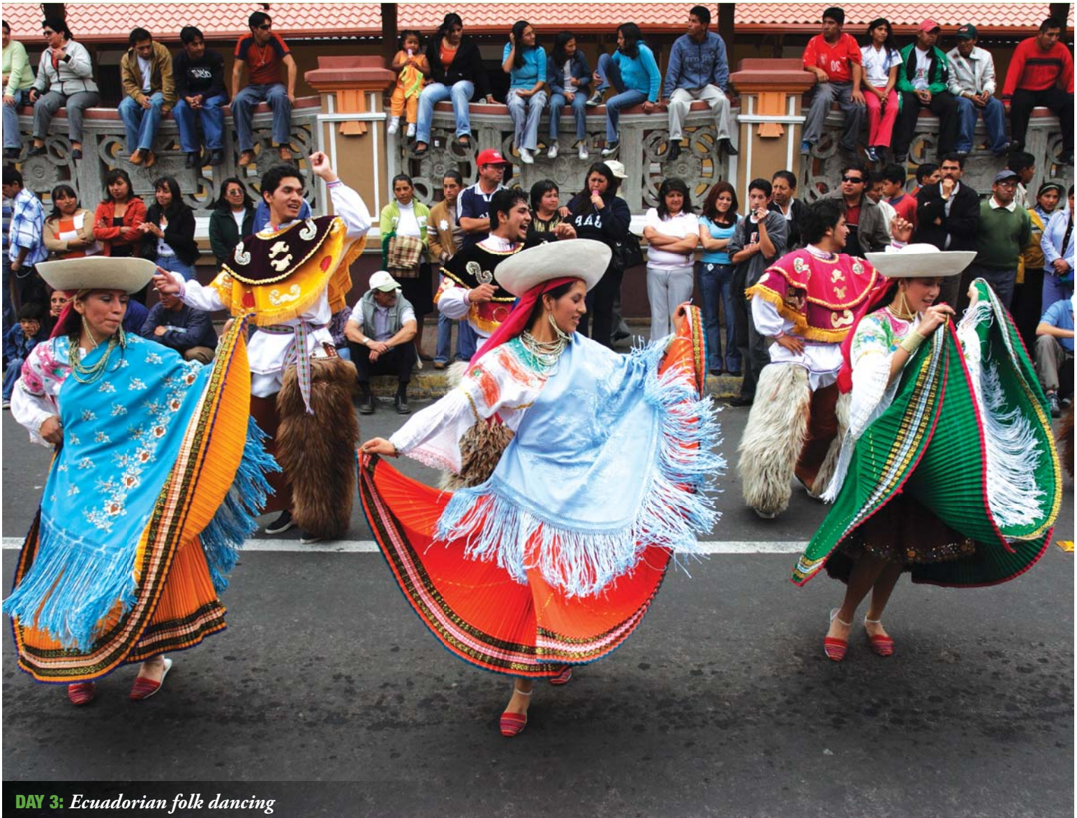
DAY 3: Ecuadorian folk dancing