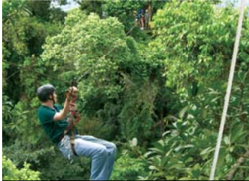
DAY 2: Canopy tour