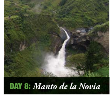
DAY 8: Manto de la Novia