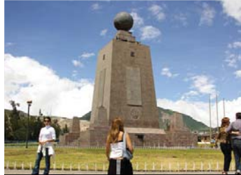
DAY 2: Equatorial Line